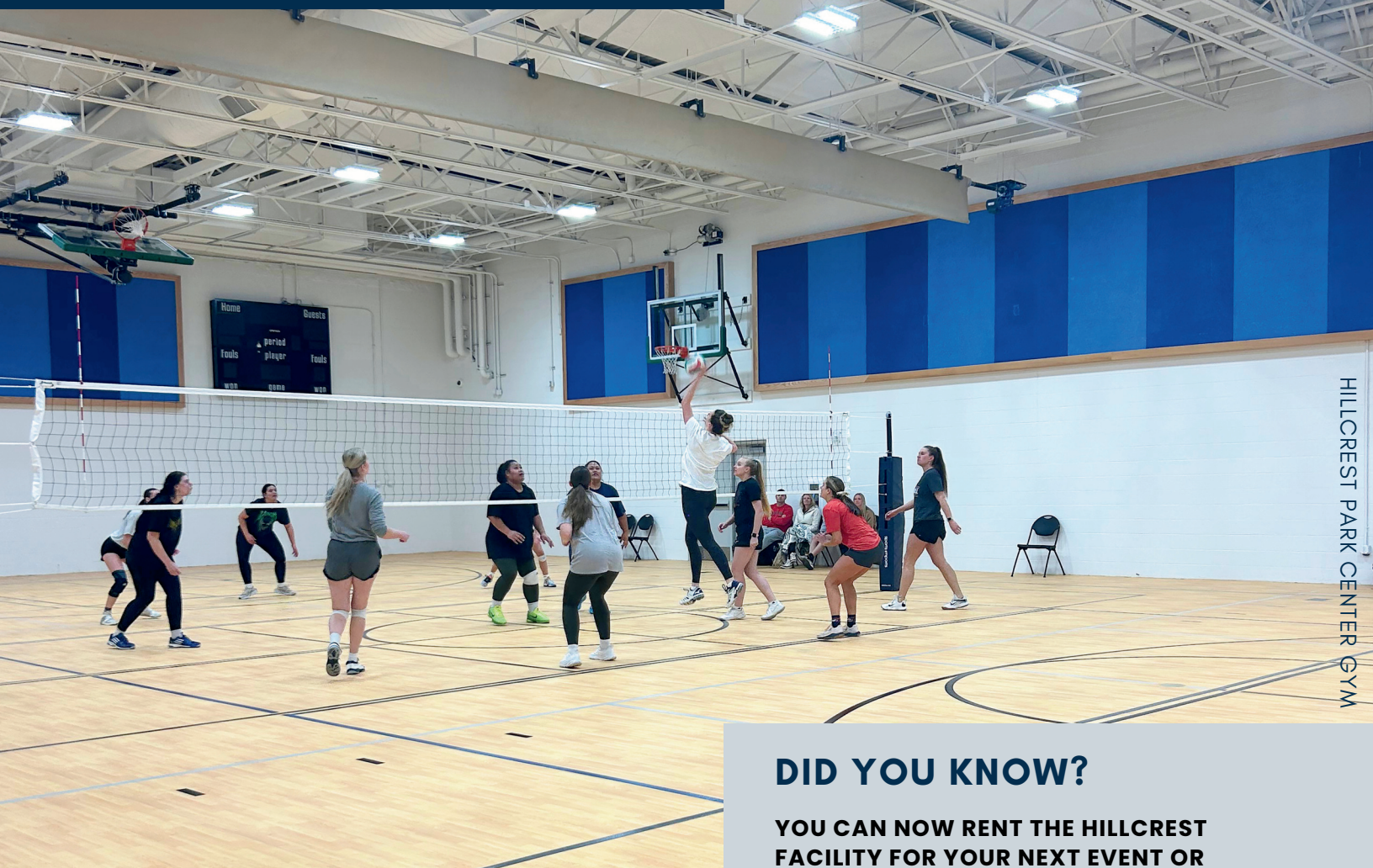
HILLCREST PARK CENTER GYM

OREM'S NEWEST PARK IS A RECREATIONAL AREA NESTLED IN A PICTURESQUE LOCATION, BOASTING AN ARRAY OF AMENITIES TO CATER TO VISITORS OF ALL AGES. THIS PARK OFFERS A SERENE ESCAPE FROM THE HUSTLE AND BUSTLE OF EVERYDAY LIFE. SINCE THE GRAND OPENING IN MAY, WE HAVE WELCOMED SEVERAL RESIDENTS TO ENJOY THE VARIOUS PROGRAMS AND BENEFITS OF THE INDOOR FACILITY, BRAND NEW PARKS, SPLASH PAD AND PICKLEBALL COURTS.