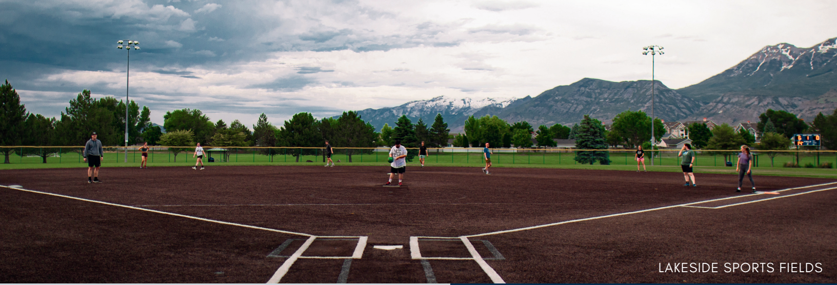
LAKESIDE SPORTS FIELDS