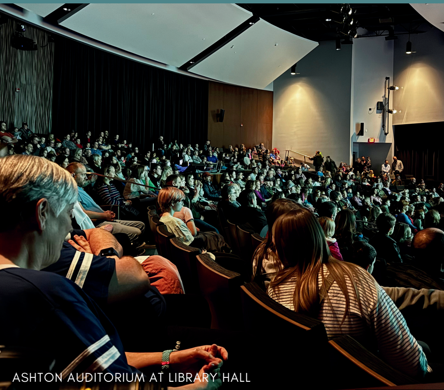
ASHTON AUDITORIUM AT LIBRARY HALL