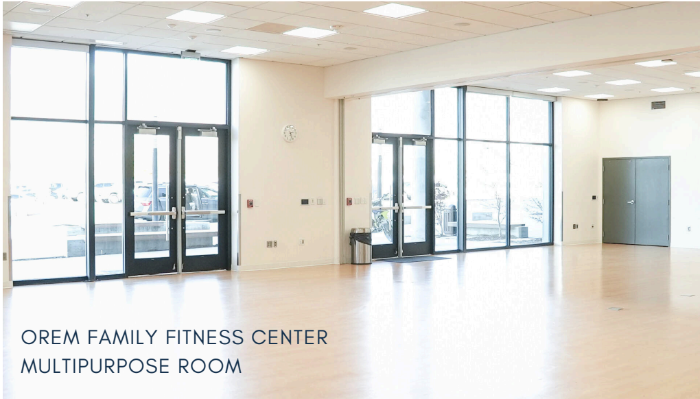
OREM FAMILY FITNESS CENTER MULTIPURPOSE ROOM

OUR MULTI PURPOSE ROOMS AT THE OREM FAMILY FITNESS CENTER ARE PERFECT FOR FAMILIES, BUSINESSES, COMMUNITY GATHERINGS OR ANY KIND OF CELEBRATION! WE HAVE OUR EAST WING AND WEST WING ROOMS THAT CAN BE COMBINED AS ONE IF NEEDED (FOR LARGER PARTIES). FULL ROOM POLICIES AND RULES ONLINE. PRICING STARTS AT $50/2 HOURS PER WING FOR BIRTHDAY PARTIES, AND $50/HOUR PER WING FOR FAMILY GATHERINGS, BUSINESS GATHERINGS, ETC. VISIT: OREMRECREATION.COM/ROOM-RENTALS