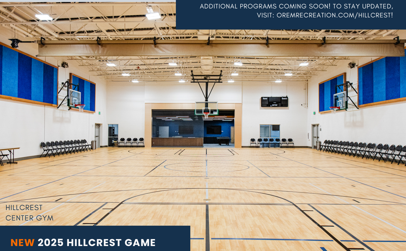
HILLCREST CENTER GYM

ADDITIONAL PROGRAMS COMING SOON! TO STAY UPDATED, VISIT: OREMRECREATION.COM/HILLCREST!