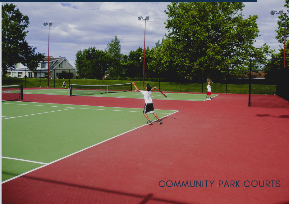
COMMUNITY PARK COURTS