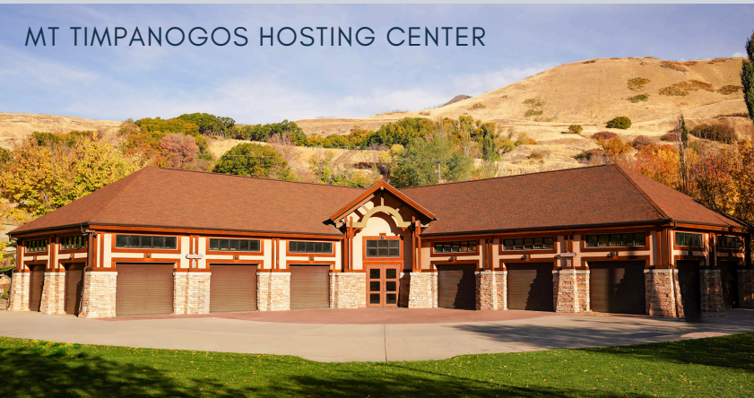
MT TIMPANOGOS HOSTING CENTER

FULL DAY RENTAL ONLY. ESCAPE TO NATURE AND ELEVATE YOUR EVENT AT OUR STUNNING HOSTING CENTER NESTLED UP PROVO CANYON. THE HOSTING CENTER IS A DELTA-SHAPED FACILITY WITH BOTH THE EAST AND WEST WINGS BEING IDENTICAL. AMENITIES FOR EACH WING INCLUDE A 24'X48' CEMENT FLOOR, WATER ACCESS IN THE MIDDLE OF WINGS, SHELVEING AND CUPBOARDS IN THE MIDDLE AREA, 8 GARAGE DOORS IN EACH WING, AND ACCESS TO ELECTRICAL OUTLETS AND OVERHEAD LIGHTS. VISIT: OREM.GOV/MT-TIMPANOGOS-PARK