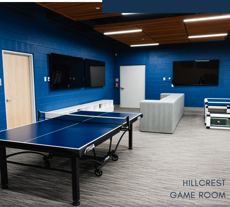
HILLCREST GAME ROOM